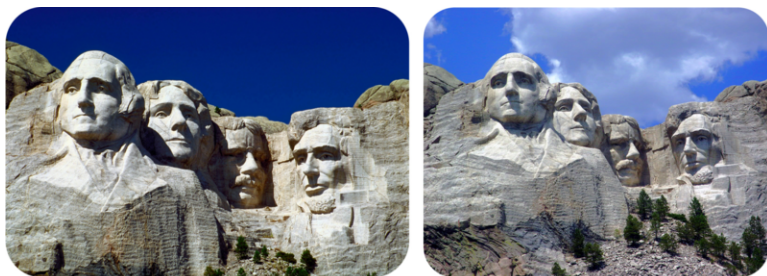
Mount Rushmore; 7:00 AM

Matter is always changing state. Look at the two pictures of Mount Rushmore in Figure 1.1 . The picture on the left was taken on a sunny summer morning. In this picture, the sky is perfectly clear. The picture on the right was taken just a few hours later. In this picture, there are clouds in the sky. The clouds consist of tiny droplets of liquid water. Where did the water come from? It was there all along in the form of invisible water vapor.